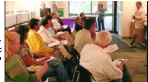
Chamber members learned how banks identify and track fake checks as well as other fraud detection methods.